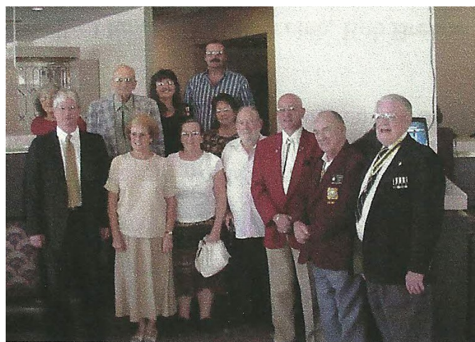
Charter members and their guests