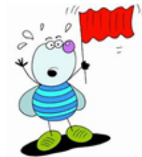
Watch out - Judgement Day ahead!

The directors may expend association funds, which shall not be deemed to be compensation to the directors, to educate and train themselves in subject areas directly related to their duties and responsibilities as directors; provided that the approved annual operating budget shall include these expenses as separate line items.