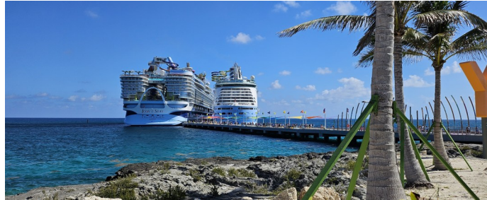
Photos from ILOH 2025, Royal Caribbean Cruise