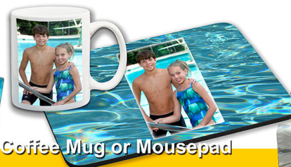
Coffee Mug or Mousepad