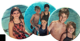
Free with every package: 3" Photo Buttons