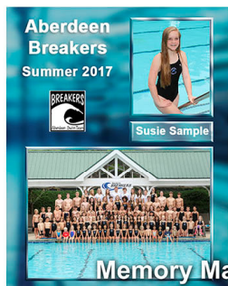
Memory Mate Includes Team and Individual Images com- bined with Name and