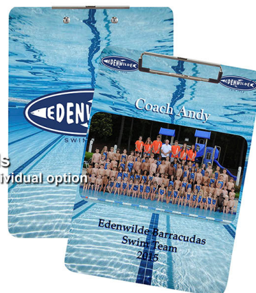
Clipboards Available in team and individual option