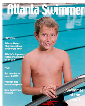
Swim Magazine Cover