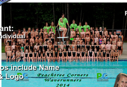
Team Photos include Name & Logo