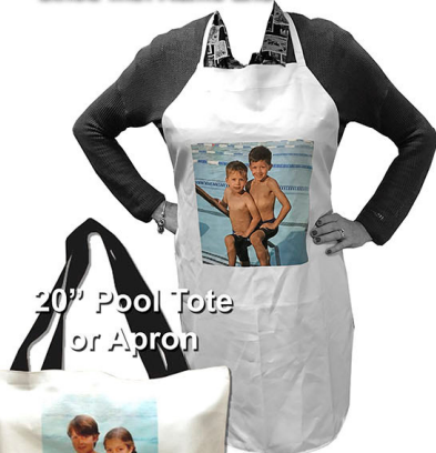
20" Pool Tote or Apron