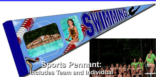
Sports Pennant: Includes Team and Individual