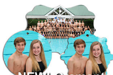
NEW! Ornaments Choose from 3 different designs