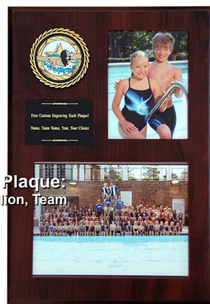
Medallion Memory Plaque: Solid Wood, Swim Medallion, Team and Individual