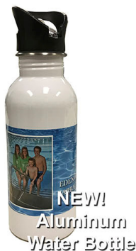
NEW! Aluminum Water Bottle