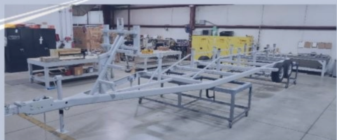
Figure 2 Post Paint