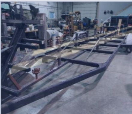
Figure 1 Before Photo