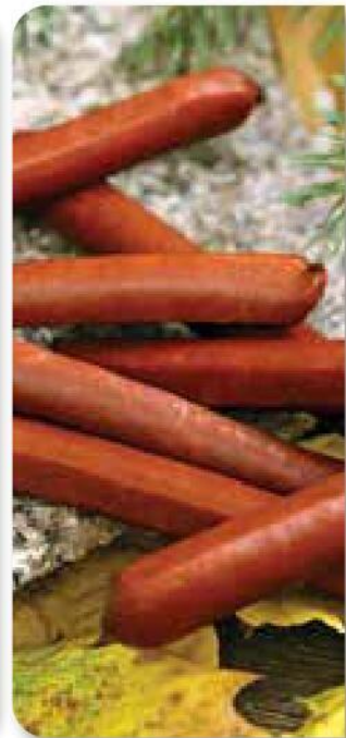
7160 - Teriyaki Venison Snack Sticks Venison and pork marinated in and tangy teriyaki. Gluten free. 7 ounces. $20