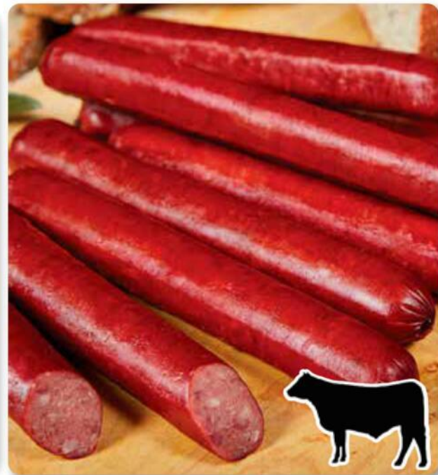
7145 - Beef Sticks Protein packed snack made with the best beef and spices. Gluten free. 5 ounces. $14