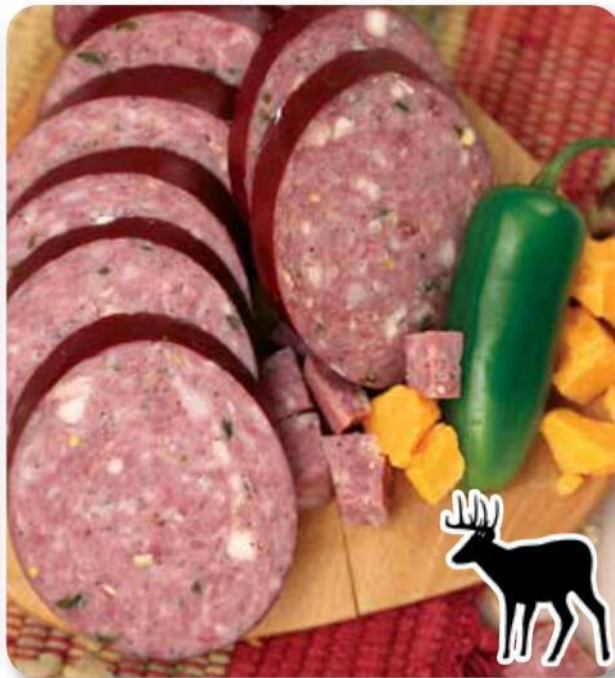
7158 - Jalapeño Cheddar Venison Sausage Venison mixed with pork, jalapeños and cheddar for an outrageously delicious snack. Gluten free. 9 ounces. $22