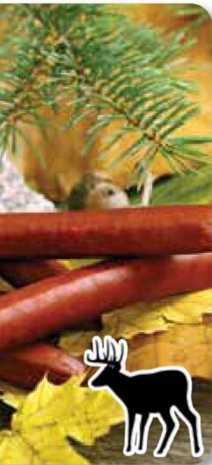
6804 - Venison Snack Sticks Mixed with a sweet gluten free. 7 ounces. $20

Creamy Grade A aged cheddar and sweet fruity port wine. 15 ounces. $16