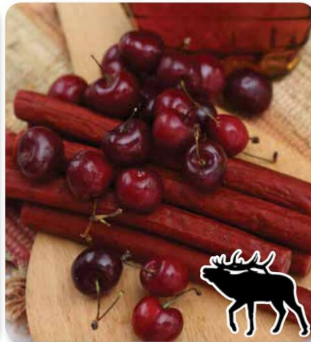
7147 - Cherry Maple Elk Snack Sticks Lean cuts of elk and a special selection of pork, maple and cherry flavor. Gluten free. 7 ounces. $20