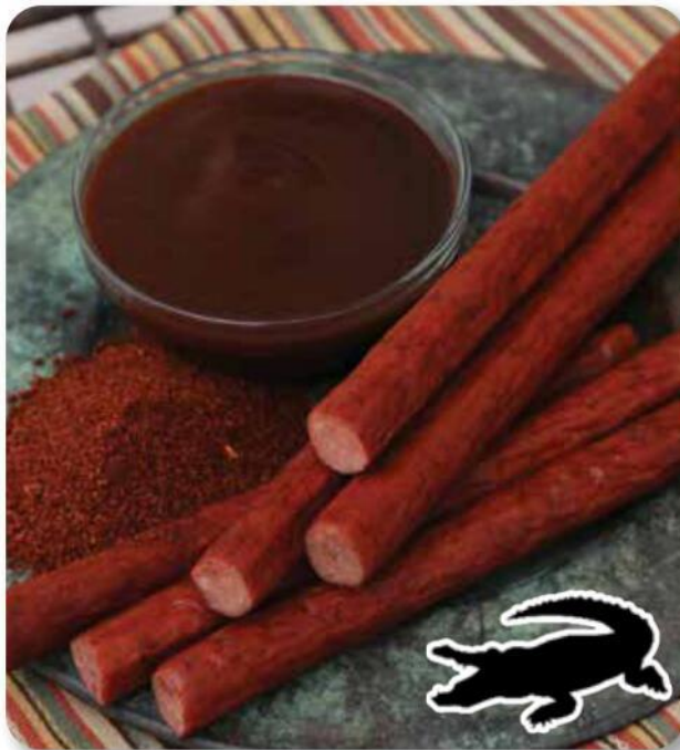
7146 - Cajun Honey BBQ Gator Snack Sticks Gator and pork done up in a special Louisiana-style seasoning. Gluten free. 7 ounces. $20

Creamy white Cheddar with garlic, parsley, oregano, and chives. 16 ounces. $16