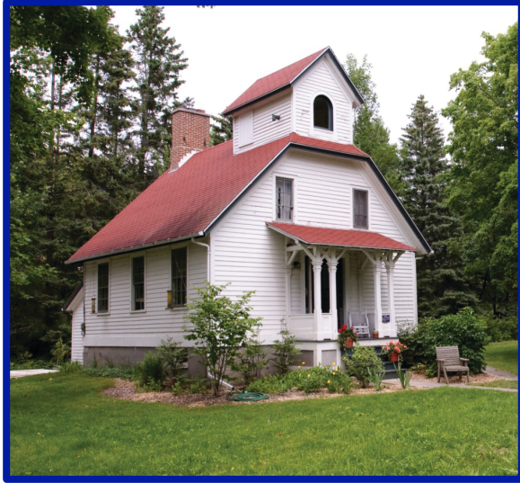
Upper Range Light