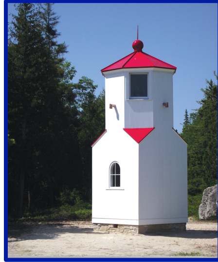
Lower Range Light