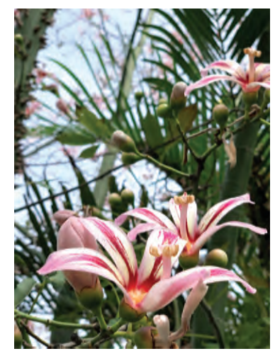
tree at my home, and it Variation in silk floss bloom

along the fence line is a Lonchocarpus violaceus, commonly called a lilac tree. The blooms are lusciously fragrant with terminal spikes on all branches in the prettiest shade of purple. This tree stays in the range of 15 to 20 feet, so it's perfect for smaller properties. It was planted in 2018 as part of a wedding ceremony. I grow this is a welcome addition,