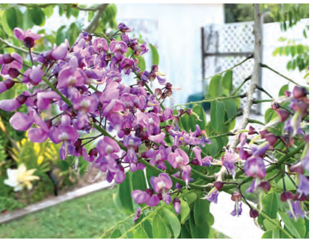
The purple flowers of the Lonchocarpus violaceus have a

Plants with brightly colored flowers, such as crown of thorns can provide a great pop of color in creamy yellow, pink, scarlet and dark red. It has many positives, including easy to care for, drought tolerant, long bloom time, no real pests and doesn't need pruning – all outweighing the thorns along the stems. The Euphorbia milli and Thai hybrid varieties are planted in a multitude of areas throughout the gardens. One such place is the research garden near the parking lot off McGregor.