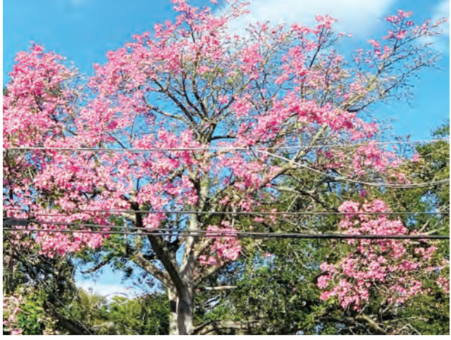
A silk floss tree near the Fort Myers-Lee County Garden Council building

950 Dunlop Road • 239-472-4648 • sanibelmuseum.org