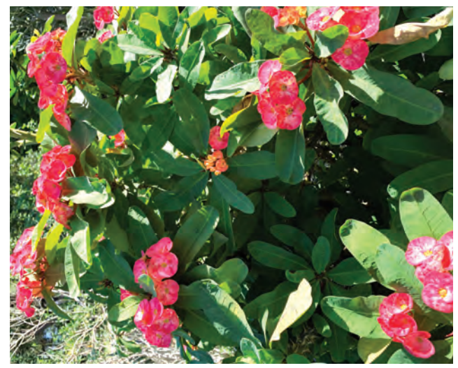
Hybrid Thai crown of thorns blooms all year long.

Over the last few years, we have been busy filling the tree canopy with an assortment of historical, native, and unusual tropical trees. Another tree new to the Ford property