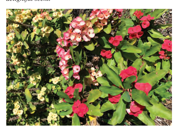
Various colors of crown of thorns.

Edison used crown of thorns as a rubber research plant because this species of Euphorbia, including poinsettias exudes a sticky latex or white milky sap. Like their cousins, poinsettias (Euphorbia pulcherrima) have been the holiday plant of choice for most Americans along with other notable plants such as orchids, cyclamen, amaryllis, rosemary, paper white daffodils and Christmas cactus. Poinsettias, which are native to Mexico, were brought to America by United States Ambassador Joel Robert Poinsett in the 1820s.