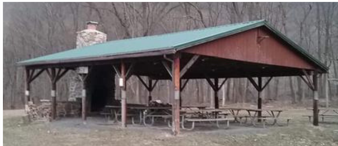
New Roof at the Pavilion