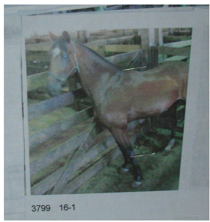
Silky Shark's EID photos at Sugarcreek, Ohio horse auction - July 2011