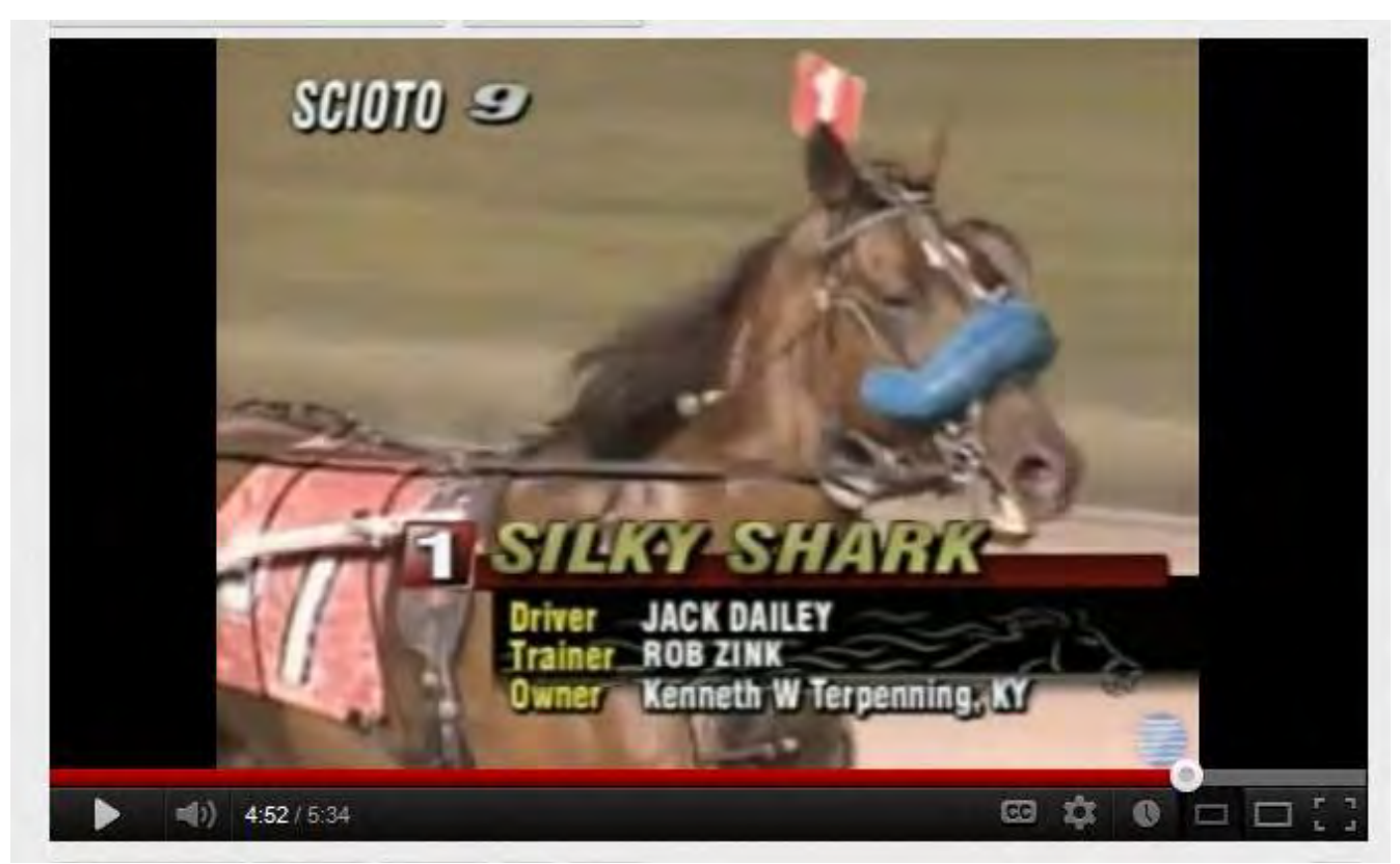
Silky Shark Wins!