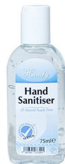
Small hand sanitizer bottle