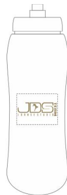
Non glass water bottle