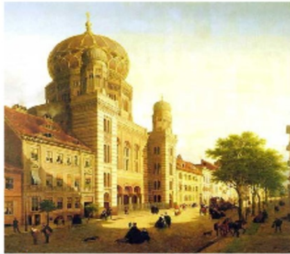
Die Neue Synagoge in der Oranienburgerstrasse (The New Synagogue built in the 19 th century on Oranienburgerstrasse in Berlin)