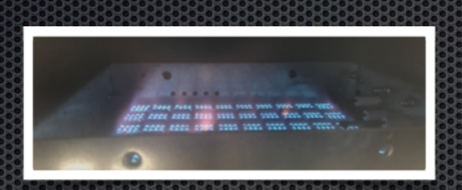
CUSTOM MADE BURNER SYSTEMS FOR BOTH ELECTRIC AND GAS

PRECISE CONTROL OVER AIRFLOW WITH STEPLESS MANUAL-DIAL DAMPER SYSTEM (MDDS)