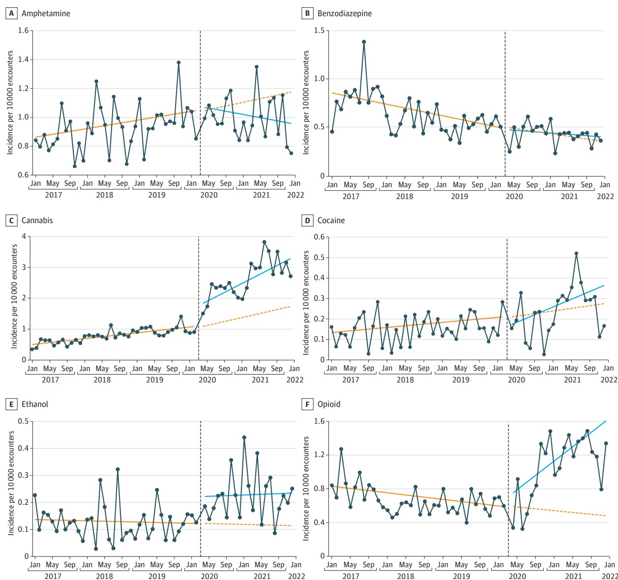
Figure 2. Ingestion Incidence Rate by Substance Type

Please note because of large differences in magnitude for different substances, scales are different on each panel. The solid orange line depicts the pre-pandemic ingestion rate trend. The vertical dashed black line depicts the onset of the pandemic. The dashed