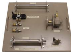
MODEL H-FP/BPS Basic Pneumatics