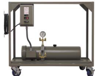
MODEL H-FP/HPS-LITE Mobile Hydraulic Workstation