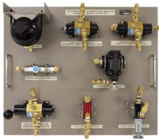
MODEL H-FP/IHS Intermediate Hydraulics