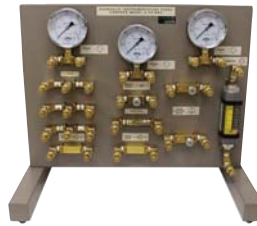
MODEL H-FP/BHS Basic Hydraulics