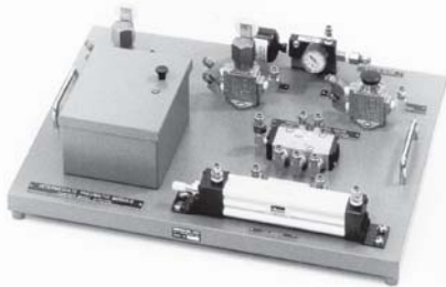
MODEL H-FP/IPS Intermediate Pneumatics