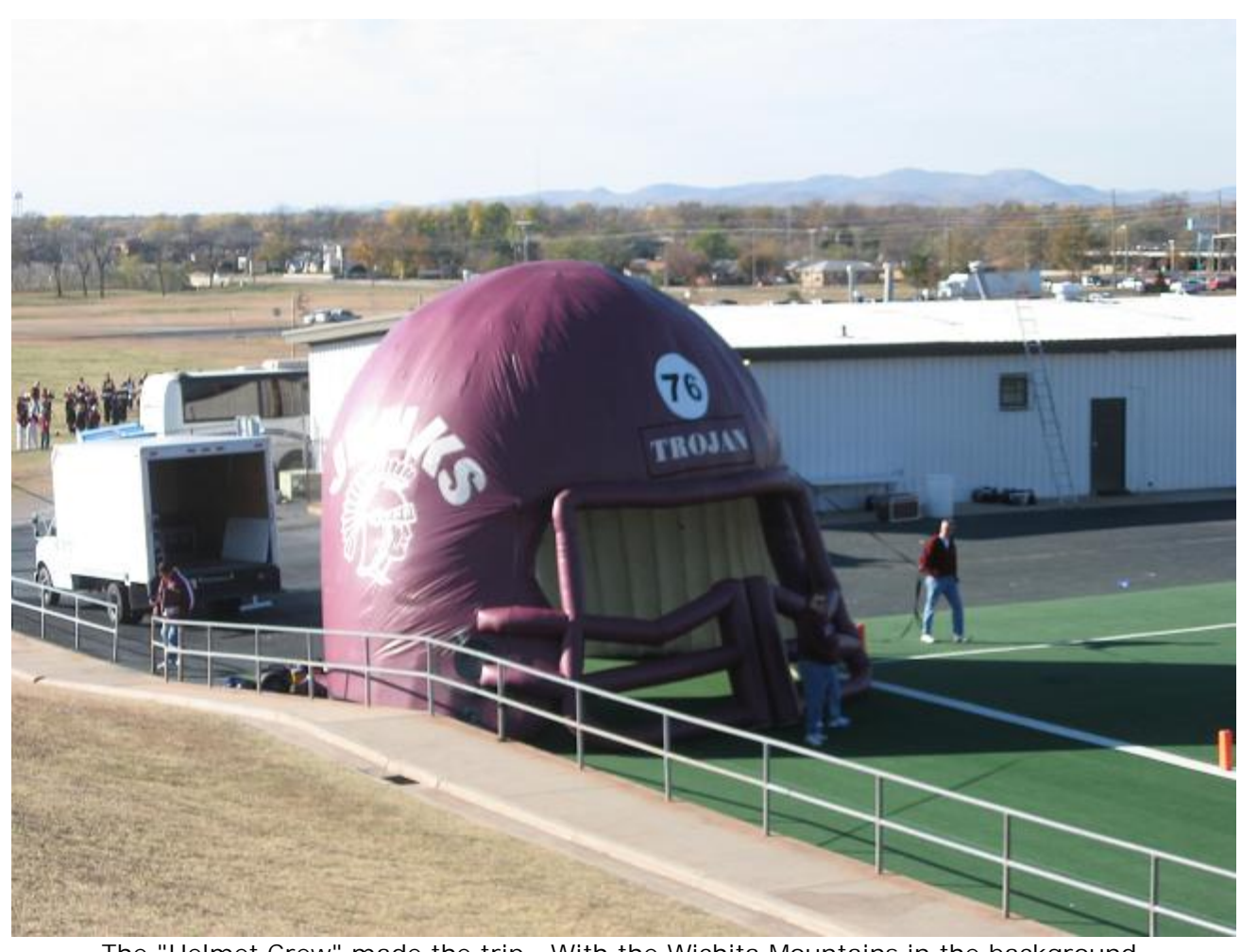
The "Helmet Crew" made the trip. With the Wichita Mountains in the background, the new 76 helmet logs made it debut.