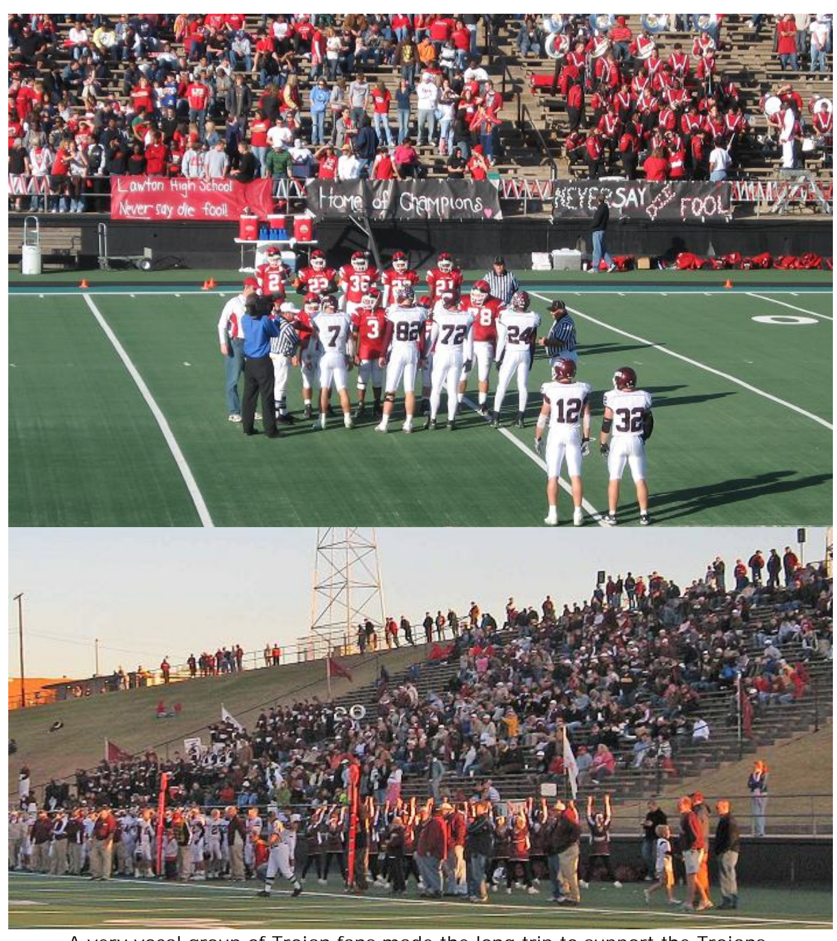
A very vocal group of Trojan fans made the long trip to support the Trojans.