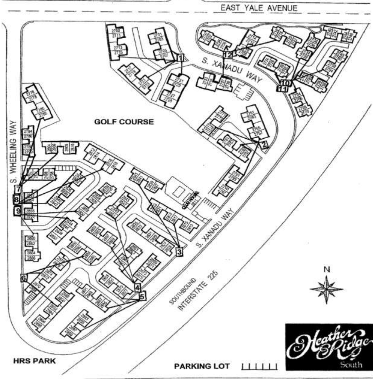
Map #3: HRS Postal Boxes and Addresses Served