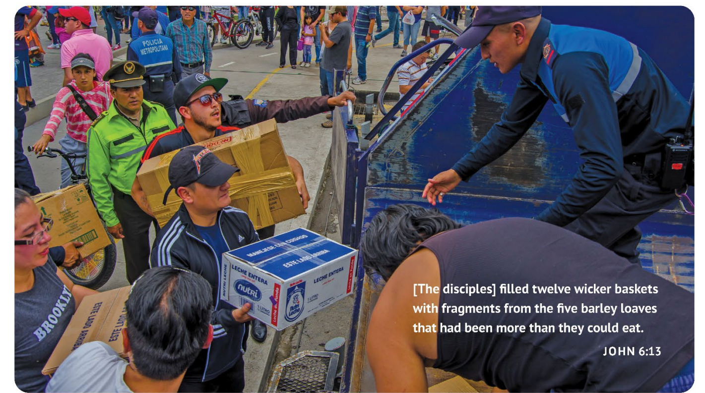
[The disciples] filled twelve wicker baskets with fragments from the five barley loaves that had been more than they could eat.

Reflect How does God feed you with what you need? Is it enough?