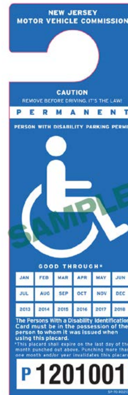
FIGURE 2: Permanent Person with a Disability Placard