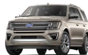
White Gold (1)

(1) Metallic paint. (2) Extra-cost option.