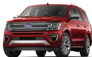
Ruby Red Metallic Tinted Clearcoat (2)