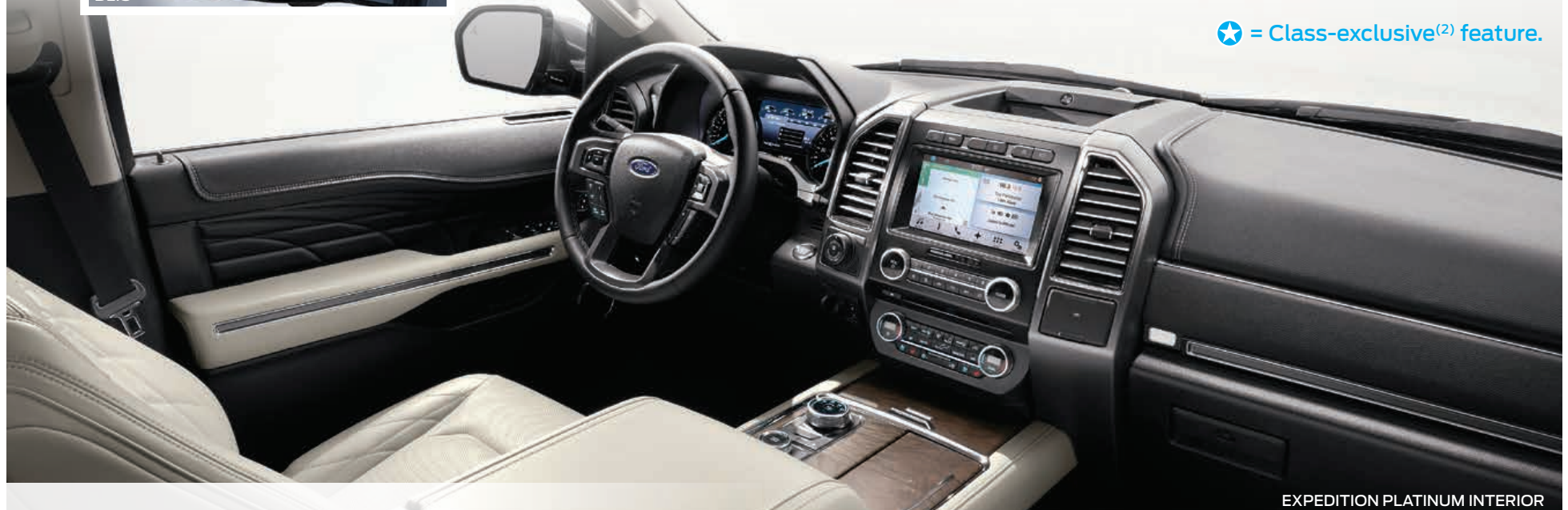
EXPEDITION PLATINUM INTERIOR