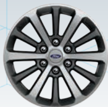
18-inch Machined-face Aluminum with Magnetic- painted Pockets