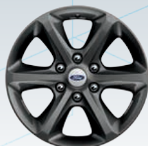
18-inch Magnetic- painted Aluminum