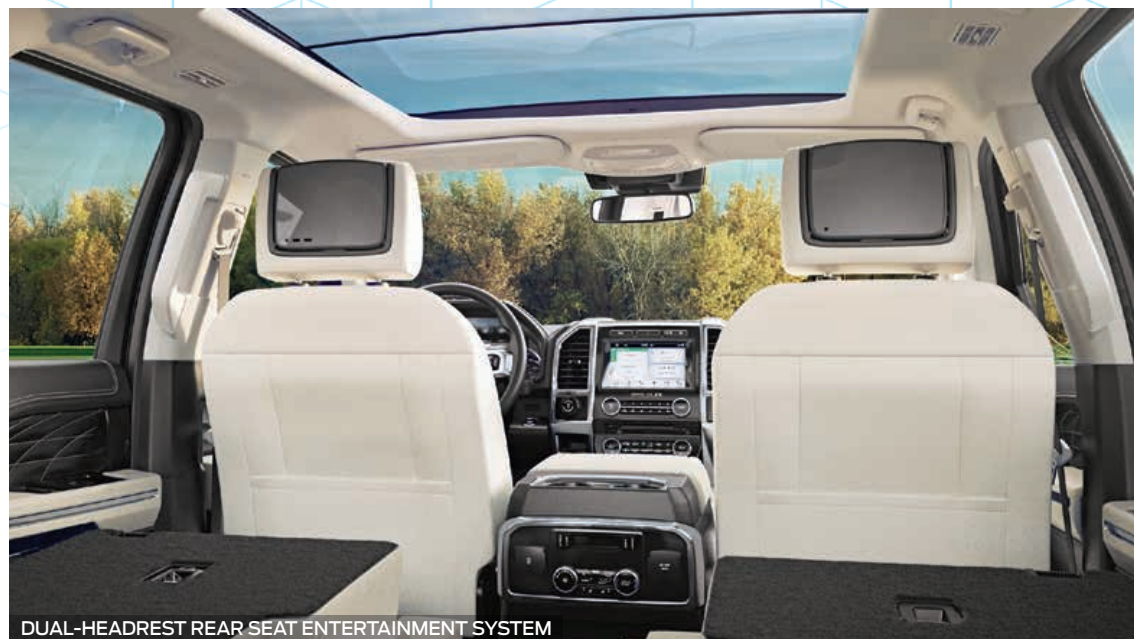
DUAL-HEADREST REAR SEAT ENTERTAINMENT SYSTEM