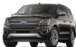
Stone Gray (1)