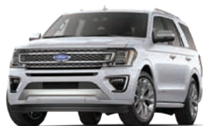
White Platinum Metallic Tri-coat (2)