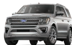
Ingot Silver (1)