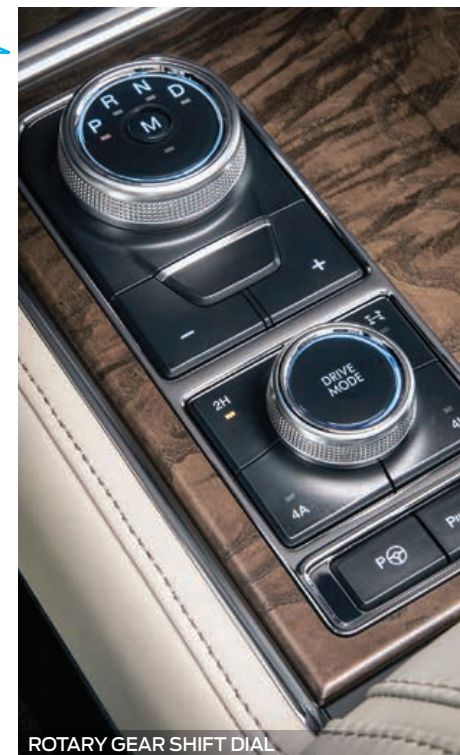
ROTARY GEAR SHIFT DIAL