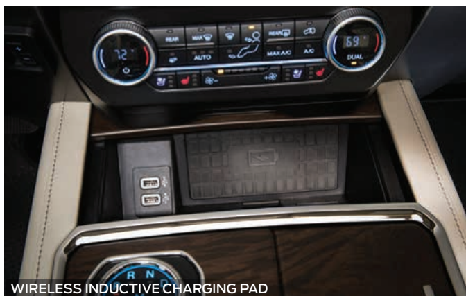
WIRELESS INDUCTIVE CHARGING PAD