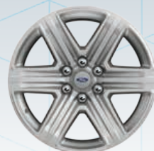
20-inch Luster Nickel- painted Aluminum