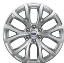
22-inch Polished Aluminum