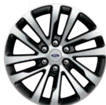
20-inch Ultra Bright-machined Aluminum with Dark Tarnish-painted Pockets