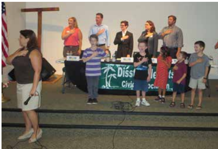
DHCA Pledge: Disston Heights children lead the Pledge of Allegiance at the DHCA candidate forum.

Visit www.casa-stpete.org/SouperBowl for additional details.