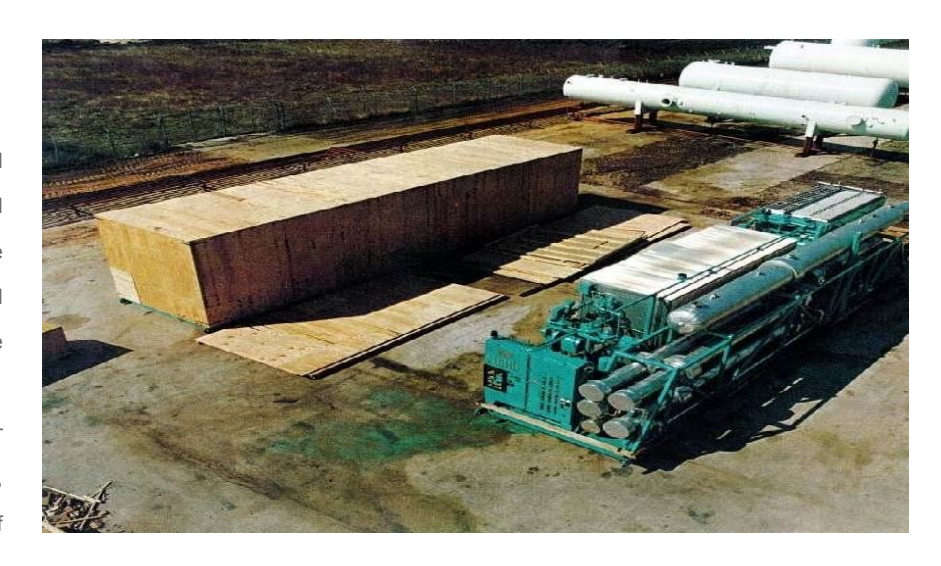
Above - Two 1,000 BPD units, one crated for overseas shipping

This plant can "thief the diesel" or desired distillate for local consumption, and then injects the unused portion of the crude back into the pipeline.