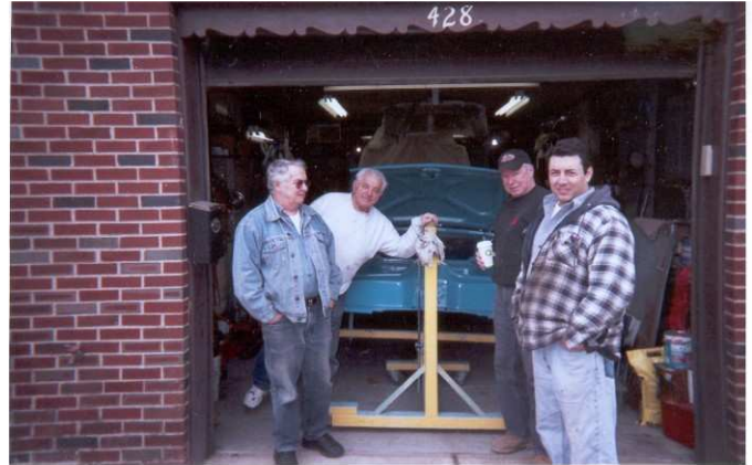
First, get some warm bodies that don’t ask too many questions.

This month’s tip is a sort of tongue in cheek pictorial of how to put that body on the frame.