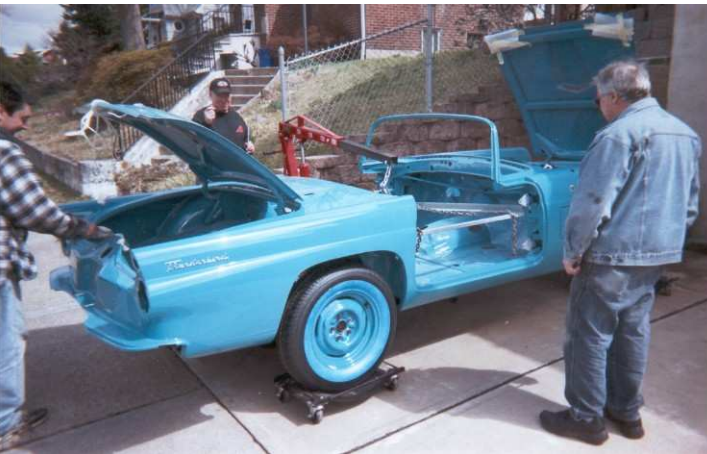
The last inch in the air

Since all hands were required to keep the body steady while in the air, there are no pictures showing this