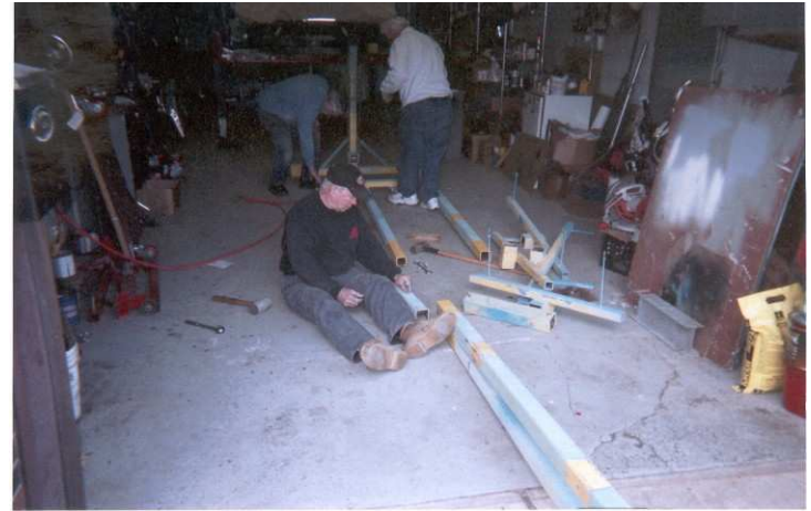
Don't forget to clean up your mess