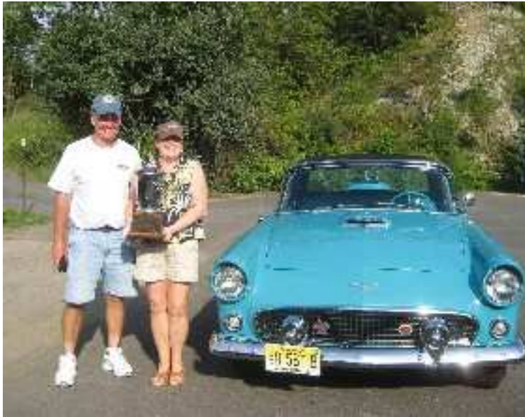
1st place at the Buckingham Concours D'Elegance

stripped frame onto our trailer and made a mad dash to have primer on the body and powder coating on the frame before rust would set in. The restoration process was long and largely dictated by “available funds”. We completed the restoration in 1998.