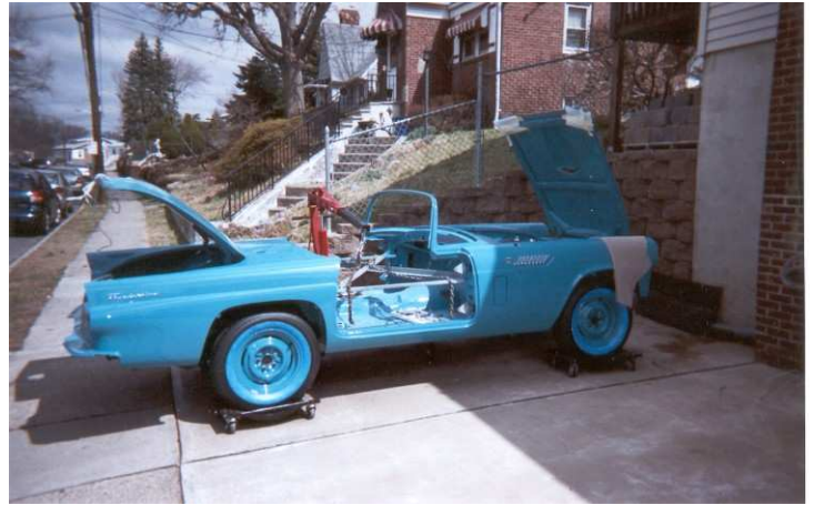
The chassis and body together