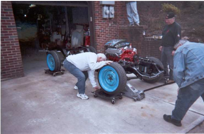
Make the chassis fully moveable-on casters

Since all hands were required to keep the body steady while in the air, there are no pictures showing this