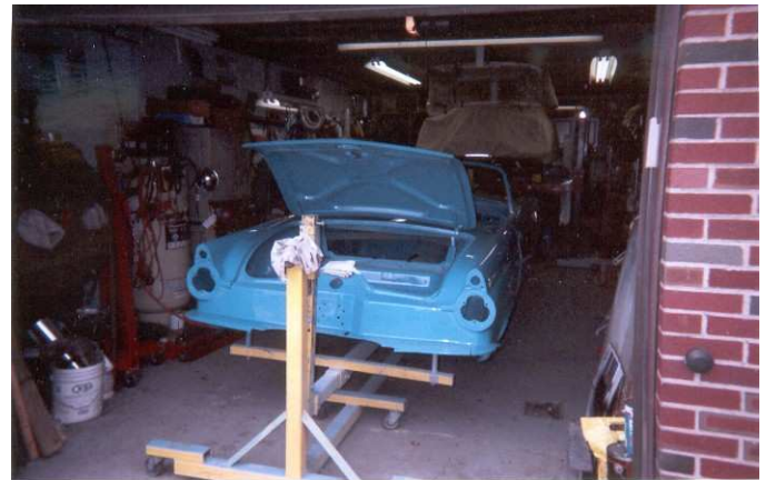
Roll the body out