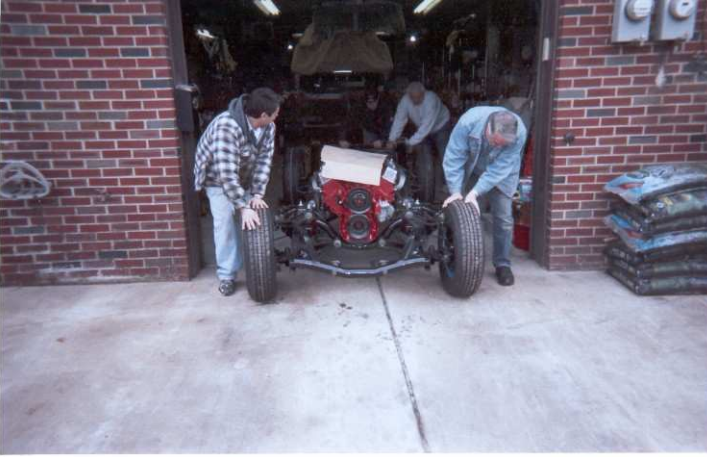
Roll the chassis out