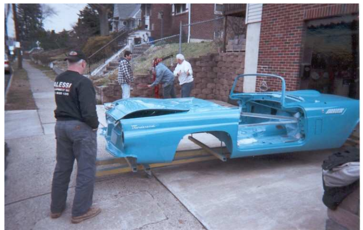
Remove from rotisserie (See Page 8 for more)