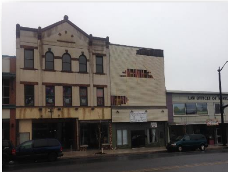
Above: Current condition of 13 E. Broad Street, which shows historic brick and window openings underneath the siding.

The Alliance is working with the Greater Hazleton Historical Society and Museum, local contractors, and the Iglesia Cristiana Monte De Si3n church (property owner), located at 13 East Broad St., to initiate what it hopes will be the first of many downtown historic façade improvement projects. The ca. 1870 building façade—including eight large window openings—was hidden by siding for more than 30 years. When the window openings were discovered, the Alliance started working with the church owners to secure the agreements and funding necessary to restore the façade back to 1920 conditions. Construction should begin this summer. Stay tuned for progress!