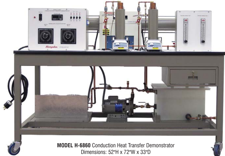
MODEL H-6860 Conduction Heat Transfer Demonstrator Dimensions: 52"H x 72"W x 33"D Weight: 800 lbs.

The major system components supplied with the unit are an electric tube furnace heatable to 316°C with a regulation of 1°C. The temperature is controlled by a manual stepless input and is indicated on a dual-scale pyrometer. Connected to this furnace on either side are metal bars of different types in a pressure contact. The heat is removed by an immersed fluid cooled heat sink of which both the fluid flow rate and temperature are monitored. The student has control