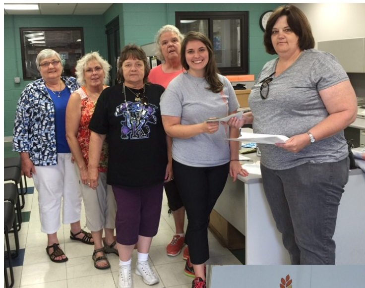
Kentucky State APWU Auxiliary presenting a check for the Feeding America Backpack Program.

At the APWU picnic held in July the Des Moines, Iowa Auxiliary had it's own table. Besides promoting their Hawthorn Hill Christmas in July Charity Drive, they also promoted a "Backpack Fundraiser." Backpack raffle tickets were sold, as well as selling ID Cardpack Holders and conducting "50/50 Deck of Cards drawings.