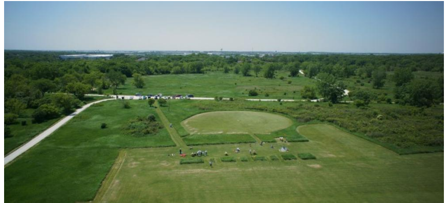
Woodland Aero Modeler’s Flying Field at Waterfall Glen Forest Preserve, Lemont, Illinois

On New Year’s Day we have our annual Frozen Fingers Fly (See From Editor, next page)