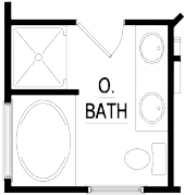
Opt. Owner Bath Upgrade