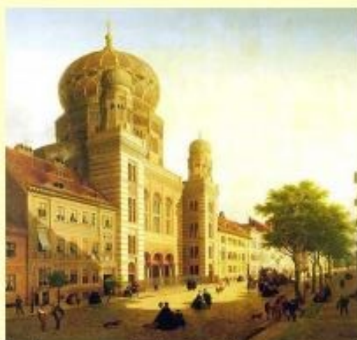
Die Neue Synagoge in der Oranienburgerstrasse, Berlin (The New Synagogue built in the 19 th century on Oranienburgerstrasse in Berlin)