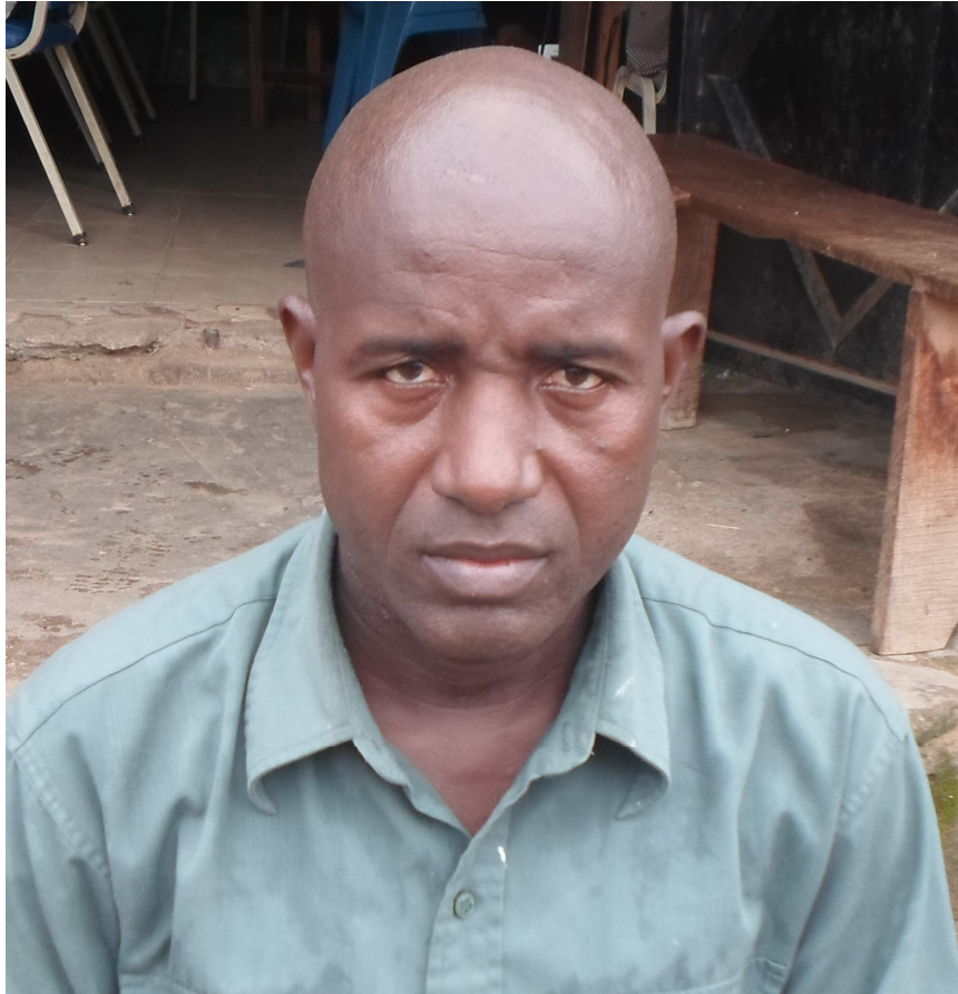
National Bishop Leo Brosius of Liberia