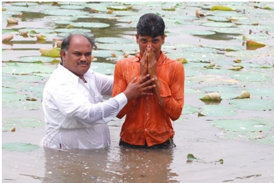
Bishop Yatham baptizing in Southern India