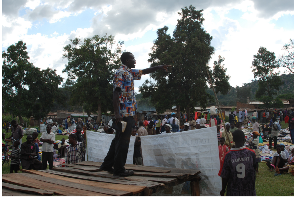
Anabaptists National Bishop of Kenya Constant Mukhoka preaching in the Malikisi Market