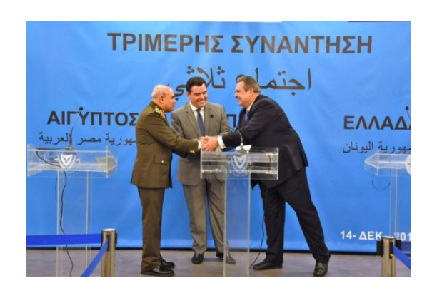
Trilateral meeting of Cyprus, Egypt, and Greece Defense Ministers

Europe. Greek Minister claimed "The defense cooperation between our countries, and after the designation of the Exclusive Economic Zone, will make possible to secure a zone within this very sensitive sea region between Suez, Cyprus, Crete and Malta, where there will be no trafficking of drugs and weapons that fund terrorism." He added that the first military drills that took place in the last two years, such as the "Medusa" drill a few days ago in Rhodes, which included a sea invasion and involved a large naval force from Egypt, the close cooperation of the Hellenic Armed Forces and Air Force with those of Egypt and the participation of observers from Cyprus, the US, Italy and other countries, "demonstrated that we can have a common military behavior where necessary." (www.cyprus-mail.com, www.mod.gov.cy)