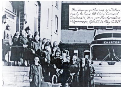
Sisters preparing to travel in 1974 to the Beatification.