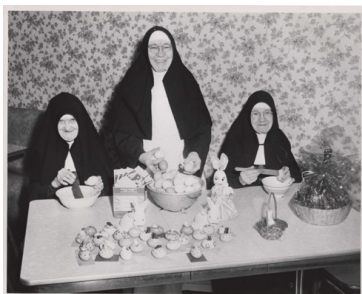
Sisters making Easter eggs.

Enjoy a grand and glorious Easter and Spring! Barb SchwabKlaco sfp -a