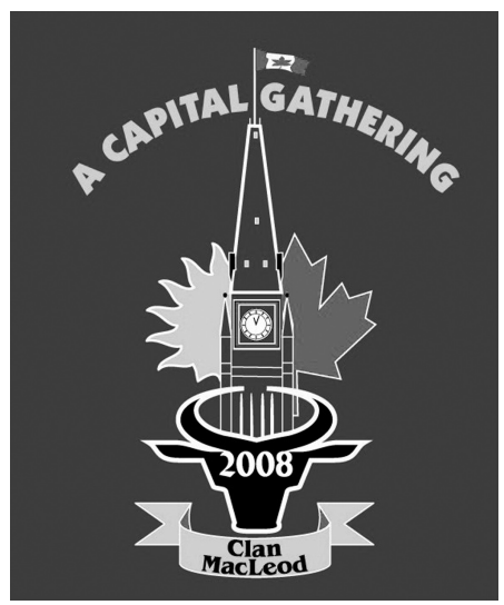
SEE YOU AT OTTAWA, ONTARIO JULY 2-6, 2008