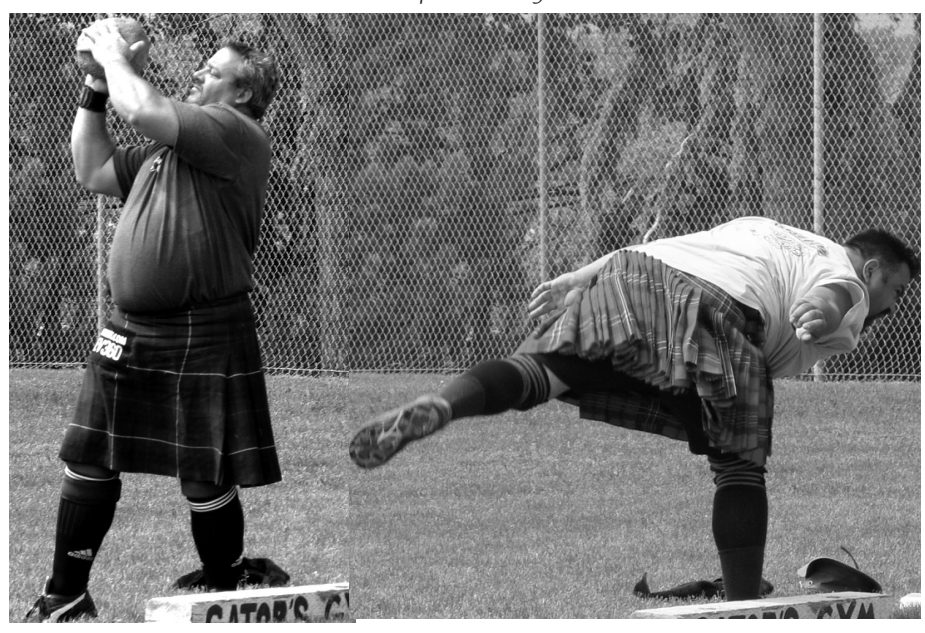
CMSC Newsletter # 48, Page 34