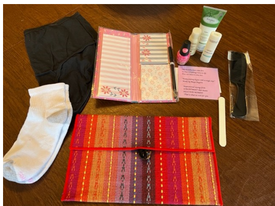
Above: Some of the items included in the Intake Welcome Kits. At Right: The finished kit.