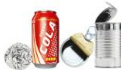
Aluminum & Steel Cans (Foil & empty food & beverage cans)