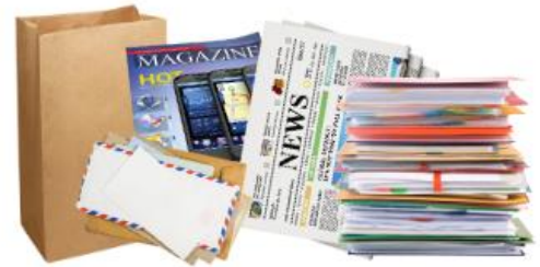
Junk Mail, Periodicals, & Office Paper (Paper bags, envelopes, & catalogs)