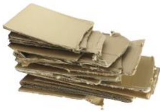
Corrugated Cardboard (Wavy center layer)