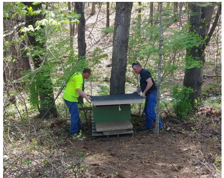
ABOVE: FELINE MOBILE HOME RELOCATION SERVICES!