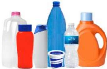
Plastic Bottles, Jugs, Tubs, & Lids (Empty kitchen, laundry, & bath containers)