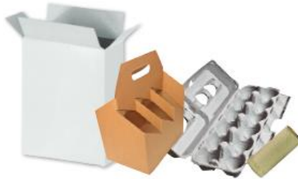
Boxboard (Dry-food boxes, egg cartons, & rolls)