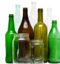
Glass Bottles & Jars (Empty food & beverage bottles & jars)