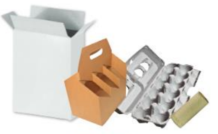
Boxboard (Dry-food boxes, egg cartons, & rolls)