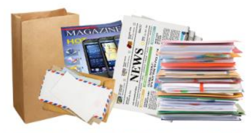
Junk Mail, Periodicals, & Office Paper (Paper bags, envelopes, & catalogs)