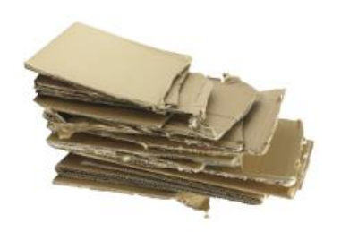
Corrugated Cardboard (Wavy center layer)