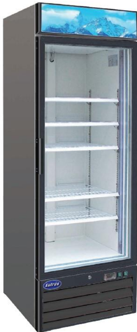
Above picture of EGD-1DF-12-HC (R290)