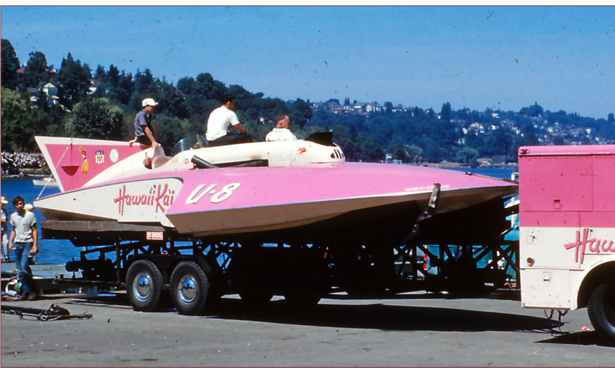
The Hawaii Ka'i in the Seattle pits for the 1958 Gold Cup.