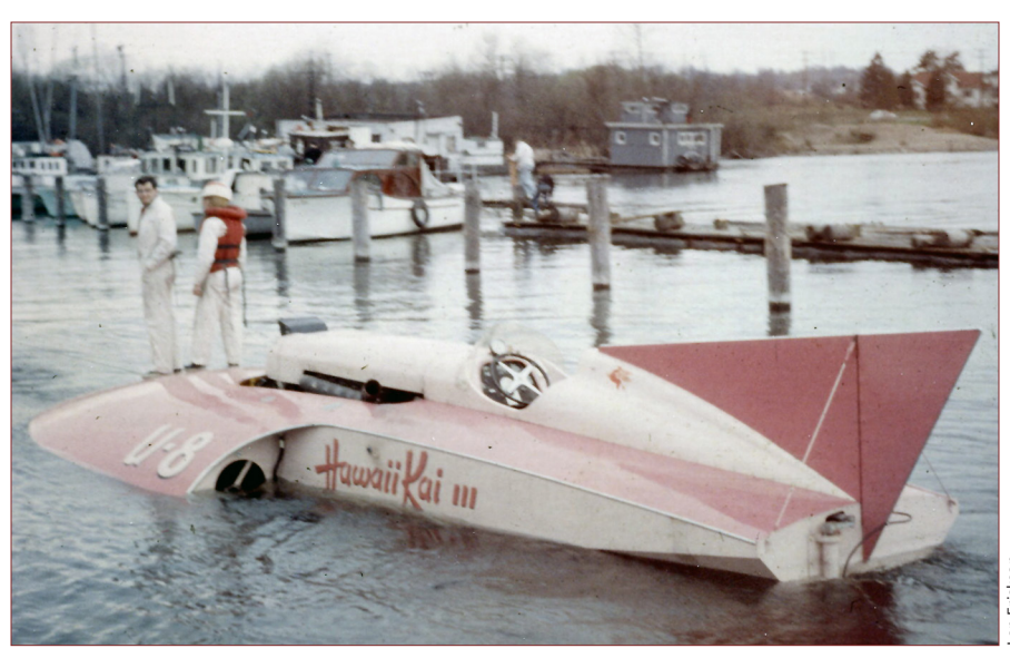
The Hawaii Ka'i following a test run on Lake Washington.

Ka'i won the race, yeah. Uh, October 12th and 13th, interesting it was later in the year. Actually, it gets hotter at that time of year down there than it does whenever we're hot up here. It kind of follows the sun. But, I was just looking here. This is Hawaii Ka'i , fastest lap,