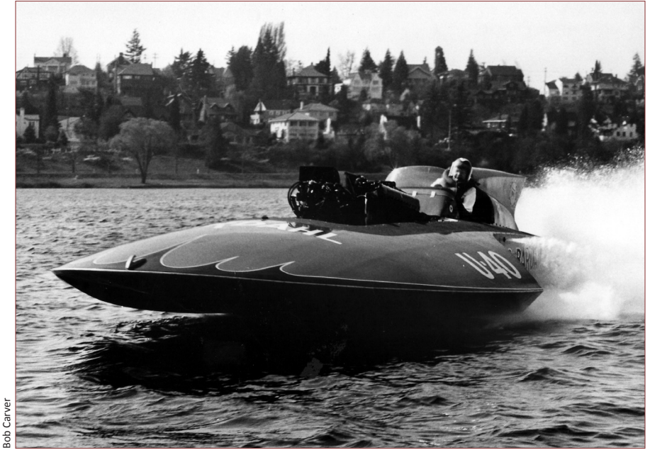
The Miss Bardahl in 1959.