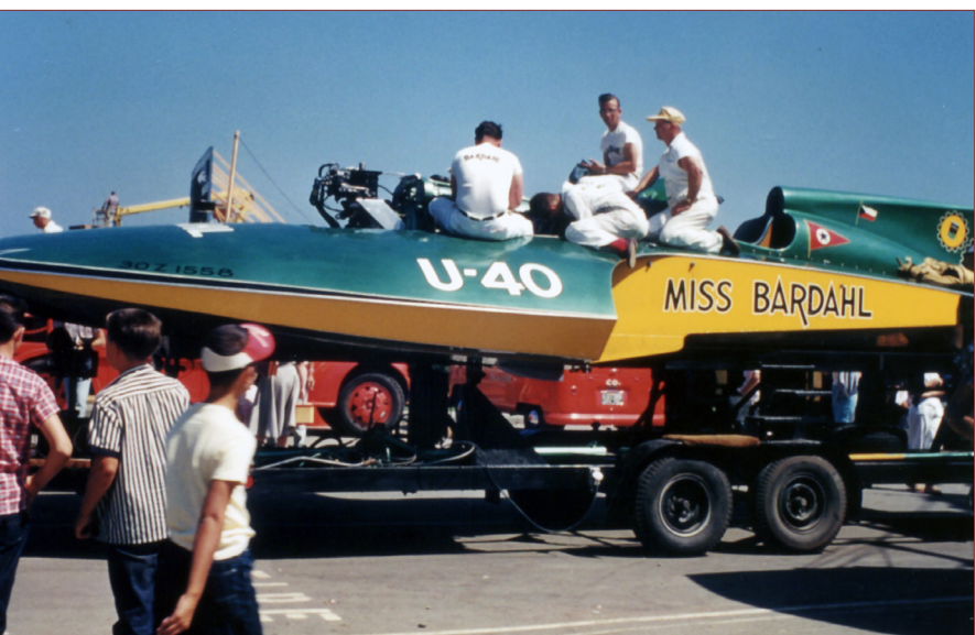
The Miss Bardahl crew working on the engine of their boat while at the 1959 Gold Cup in Seattle.

Yeah, I've got a lot of data on their stories about KING-TV and