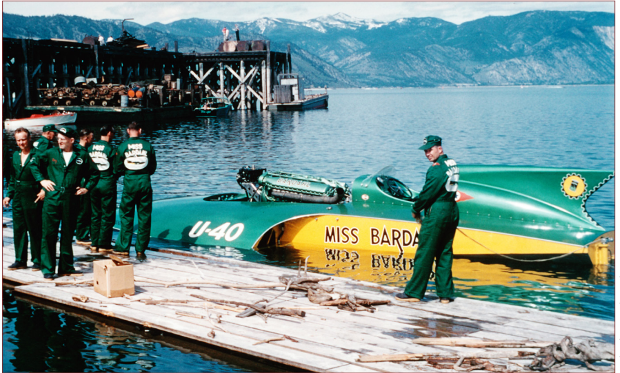
The Miss Bardahl at the dock during the 1959 Apple Cup on Lake Chelan, Washington.