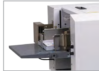
Side Air Blower