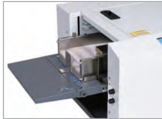
Air Suction Feed System