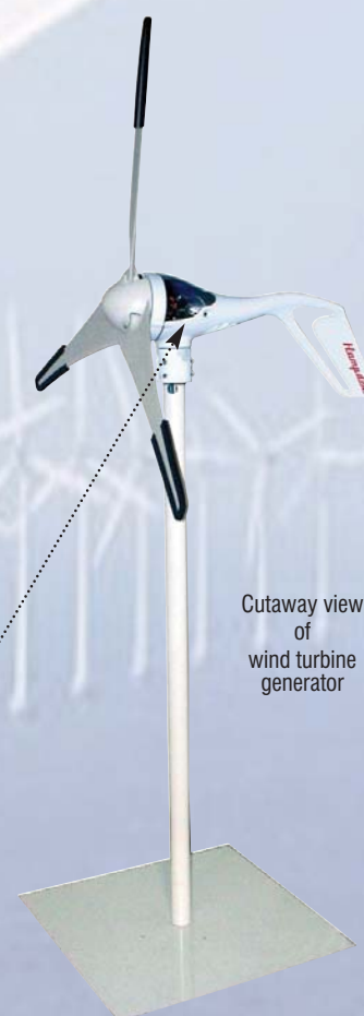
Cutaway view of wind turbine generator