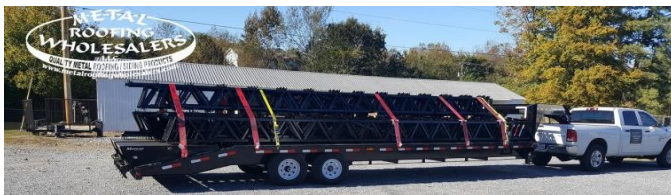
Bar Joist-Header Truss