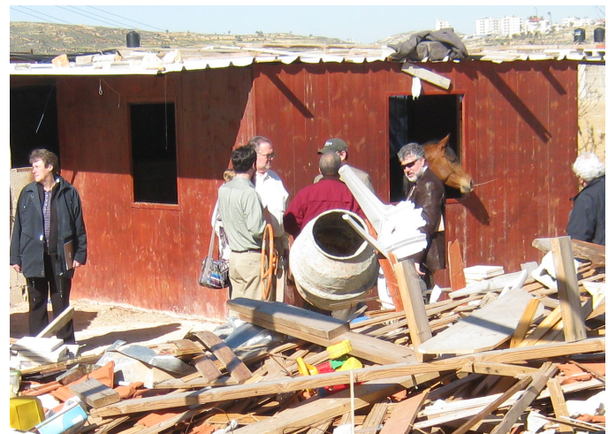
United Methodists visit a destroyed home in 2010. All that's left is the shed for animals, a crude shelter for a family with children.

administration in recent memory has said that the settlements are illegitimate." Every United Methodist General Conference since 2004 has passed a resolution calling for an end to Israeli settlements on Palestinian land. In 2012, the General Conference called on all nations to boycott settlement products.