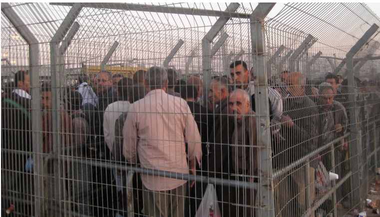
Workers line up at checkpoints hours before dawn, hoping to be allowed through to reach their jobs and provide for their families. Employers cannot be sure when or if workers will arrive.

Israel says that the Separation Wall is for security, yet it is not built on the border between Israel and occupied Palestinian territory; in fact, 85% of the Wall's route is on Palestinian land. Much of it extends deep inside the West Bank. In effect, the Wall is illegally annexing Palestinian land to Israel. The International Court of Justice has declared the Wall illegal and called for all portions in the occupied territory to be dismantled. Israel has ignored the court's decision.