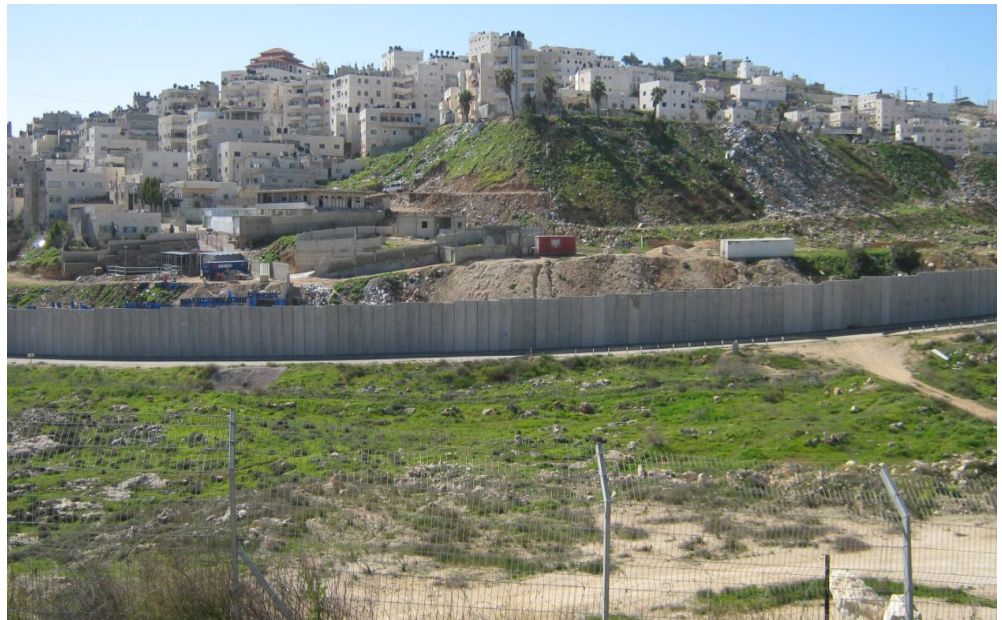
On the map, blue lines are Israeli-only highways dividing the West Bank, shown in the dotted border. Dark gray areas are part of Israel; light gray and blue areas are controlled by Israel. Orange areas are Palestinian. (Map by Jan de Long.)

The Fourth Geneva Convention forbids an occupying power from moving its own people onto land it occupies. Since 1967, however, Israel has built more than 120 illegal colonies called "settlements" in occupied territory, which includes East Jerusalem. Using tax incentives and other economic benefits, Israel has encouraged over 650,000 Jewish settlers to move onto Palestinian land. This is a serious, ongoing violation of international law and an enormous obstacle to peace between the two peoples.