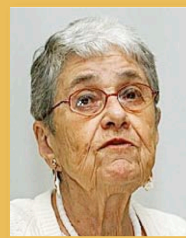
Hedy Epstein, Holocaust survivor and human rights advocate:

Palestinians live with the fear that in an emergency they will not be able to reach a hospital. Many mothers have given birth at checkpoints, and dozens of newborns have died there. Other patients have died or suffered irreversible setbacks at checkpoints. Such deliberate delays in medical care are illegal under international law and have been condemned by human rights organizations around the world.