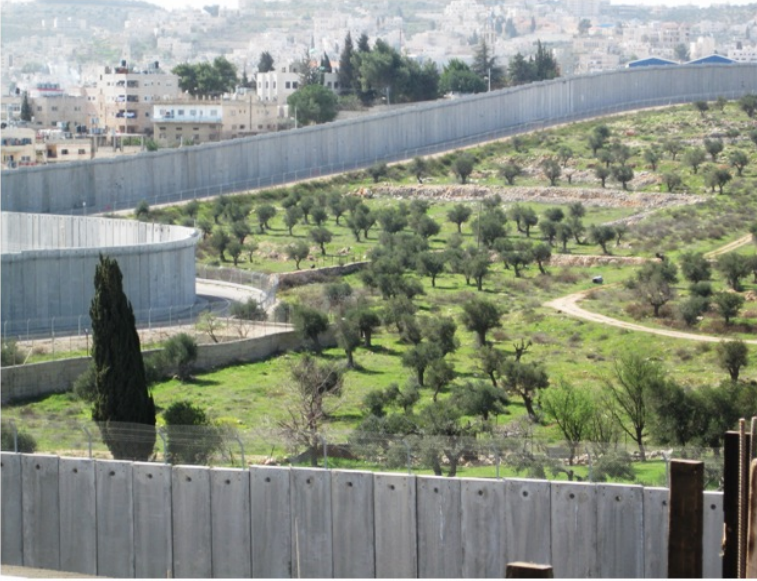
The Separation Wall surrounds Bethlehem, confiscating the residents' farmland for Israel and isolating Bethlehem from other communities.

The Separation Wall, checkpoints, and barriers throughout the West Bank turn Palestinian communities into open-air prisons.