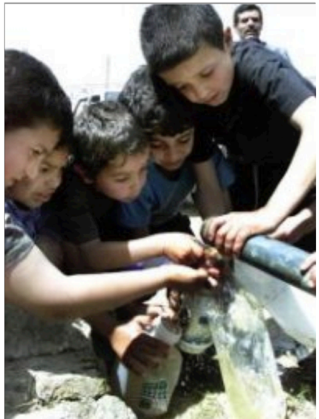
Palestinian children struggle to fill their bottles while the water is flowing from an outdoor pipe in their village. In Gaza, where drinkable water is especially scarce, over half the population is under the age of 18.

In Gaza, home to 1.8 million Palestinians, the underground aquifer is depleted and contaminated. A report by Save the Children states that water-related illnesses like typhoid fever and diarrhea have increased sharply. More than 90% of the water supply is unfit for human consumption.