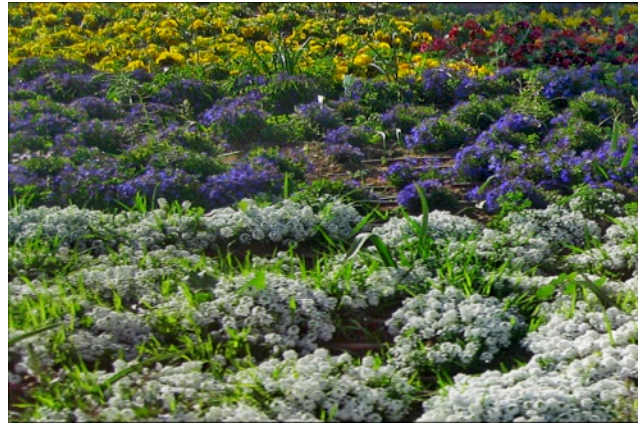
Israeli settlers have access to four times as much water as Palestinians – enough for pools and gardens.

Israel controls all the water in the occupied territories, and water restrictions have created a humanitarian crisis for Palestinians. Despite the fact that the region’s largest aquifer lies primarily beneath the West Bank, hundreds of thousands of Palestinians don’t have access to running water.