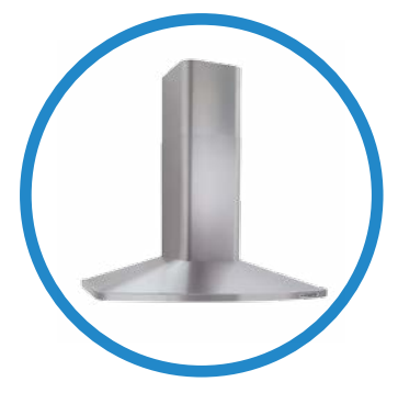
KITCHEN VENTILATION expels cooking effluents from food preparation to eliminate airborne pollutants from spreading through the entire house.