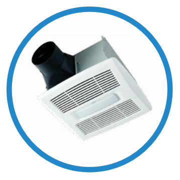
EXHAUST VENTILATION removes excess moisture and odor from any room in the home, and can also provide continuous, whole-house ventilation.

From clearing humidity in the bathroom to removing heat, steam and airborne effluents in the kitchen. From whole-house HEPA air filtration and balanced fresh air exchange solutions to attic ventilation. From the family room to the master bedroom and in every room in between, no company knows residential and light commercial ventilation like Broan-NuTone. After more than 80 years, countless innovations and a commitment to indoor air quality, trust Broan to clear up every concern.