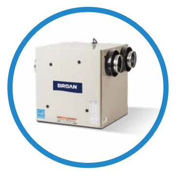
FRESH AIR SYSTEMS efficiently exchange inside air with fresh outside air, and remove airborne particulate with HEPA filtration.