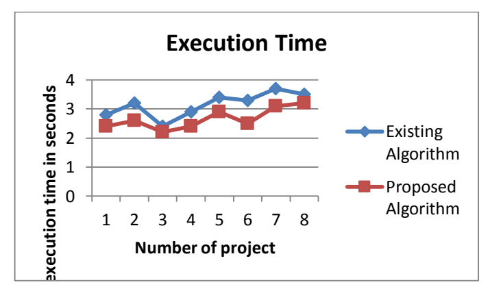
Fig 3: Execution Time

As shown in figure 1, the proposed algorithm and existing algorithm are compared in terms of fault detection rate. It has been analyzed proposed algorithm performs well in terms of fault detection rate.