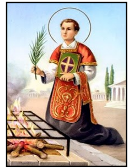
Feast Day: August 10

The prefect was so angry he told Lawrence that he would indeed have his wish to die—but it would be by inches. He had a great gridiron prepared with coals beneath it, and had Lawrence's body placed on it. After the martyr had suffered pain for a long time, the legend concludes, he made his famous cheerful remark, "It is well done. Turn me over!" St. Lawrence's Feast is celebrated on August 10, the date of his death. He is the patron saint of cooks, deacons, and the poor. Source: franciscanmedia.org