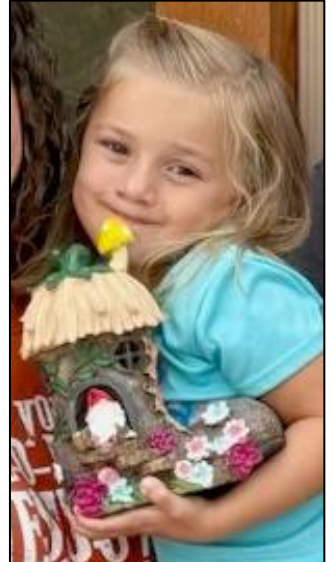
This Gnome has a new home

The family is also joined by their two lovable