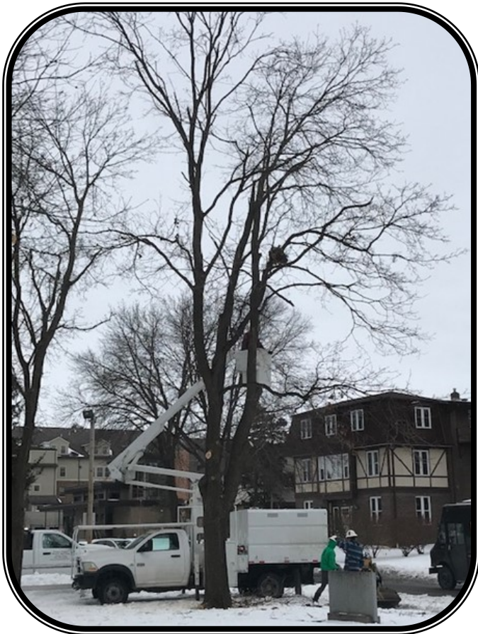
A tree service trimmed the two large oak trees in the front yard and removed a damaged maple near the street recently.

For more information on the book or to order a copy, click here . Or you can call or email the church office and we will order a copy for you for $10. Order deadline is February 27.