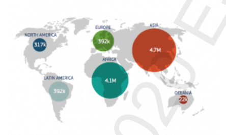
Figure 1: Deaths attributable to antimicrobial resistance per annum between 2015 and 2050. (Adapted from Review on Antimicrobial resistance, Antmicrobial resistance: tackling a crisis for the health and wealth of nations, Dec 2014)

AMR is present in all countries and is of global concern. It usually happens through genetic changes; however, inappropriate antimicrobial use in people and animals is accelerating this process. Of real concern is new resistance mechanisms emerging and spreading globally. Such threats reduce our ability to treat infections in some seriously ill patients, particularly in ICU patients, immunosuppressed and post-transplant patients. A further worry is the increasing incidence of resistant pathogens producing infection in the acutely unwell patient. These include: MRSA (10%), Coagulase negative staphylococcus, Enterococci (10.6%), Klebsiella (12.6%), Enterobacter (6.9%), P. aeruginosa (20%), Acinetobacter (8.9%) and Stenotrophomonas maltophillia. AMR contributes to 25,000 deaths per annum in the EU, globally it could be as high as 1,700,000. If current infection and resistance trends are not reversed WHO predicts 10 million deaths per annum between 2015 and 2050 with the largest numbers in Africa and Asia.