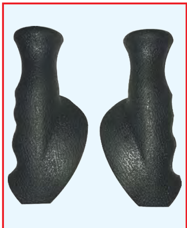
Soft ergonomic handgrips