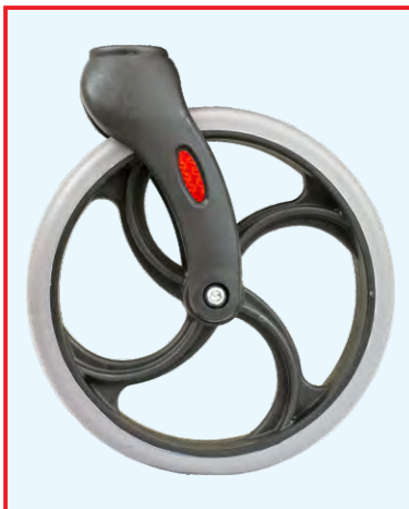
Front wheel reflectors