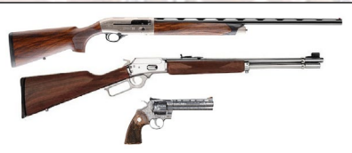
Beretta A400 Upland – 28 ga., Marlin 1894 Classic .44 Mag/.44 spc Colt Python 6" .357 Mag..

Tickets $50 - 1 Winner 2024 DU Guns of The Year or 1/2 the cash if all 150 tickets not sold